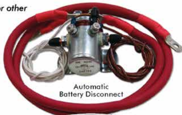
Automatic Battery Disconnect

To see which vehicles can use the Automatic Battery Disconnect, visit www.roadmasterinc.com