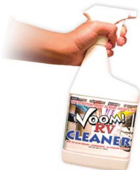
Voom RV cleaner (part number 9911)

Note: to remove scratches and restore luster on the stainless steel arms, we suggest extra fine (0000) steel wool, 3M “Scotch Brite” (fine pad) or a similar product.